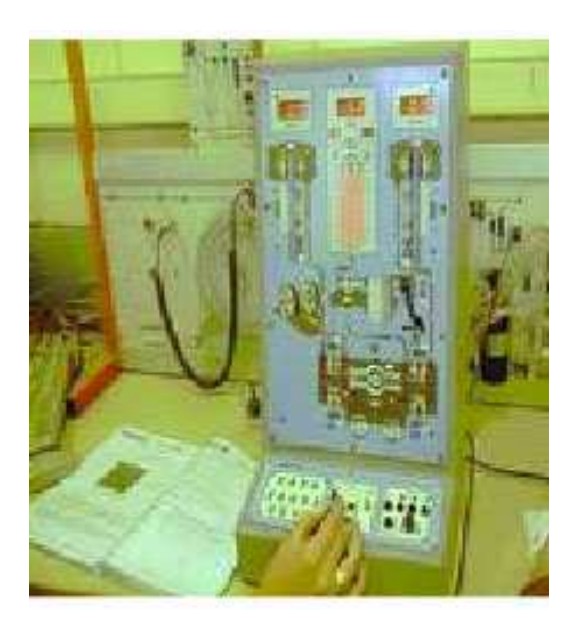
Figure 2. Example of a braking simulation system, presented p. 4 (Ndoumatseyi Botongoye, 2007)

Landry Ndoumatseyi-Botongoye (Ndoumatseyi Botongoye, 2007) has conducted a study in Gabon with students enrolled in a maintenance course who used this kind of resource. According to him, the simulation models look like real systems but because of their scaletall, it is possible to show that all components may not be at the same place as in real systems.